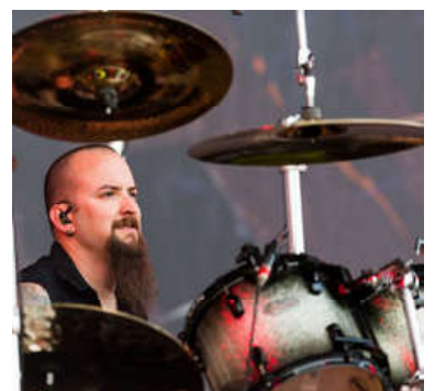
Sänger David Draiman, Bassist John Moyer, Gitarrist Dan Donegan & Schlagzeuger Mike Wengren