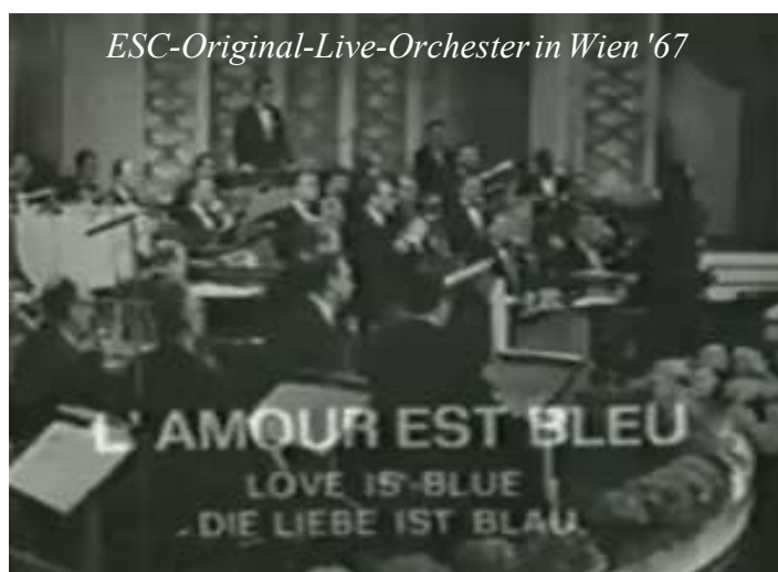
ESC-Original-Live-Orchester in Wien '67