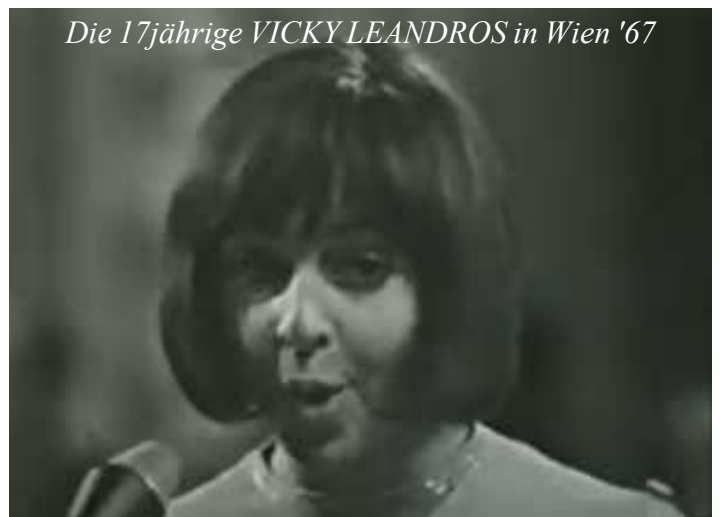
Die 17jährige VICKY LEANDROS in Wien '67