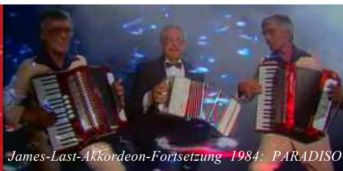
James-Last-Akkordeon-Fortsetzung 1984: PARADISO