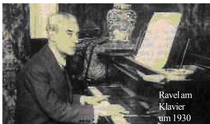
Ravel am Klavier um 1930

In Germany, the melody became particularly well-known through the campaign broadcast at the end of the 1980s to draw attention to the risks of AIDS. In the musical increase of the Boléro (through the addition of further instruments), more and more people were brought into the picture during the campaign to signal how quickly the virus can spread.